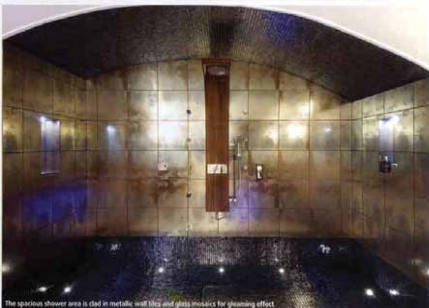
The spacious shower area is clad in metallic wall tiles and glass mosaics for gleaming effect

want to use the same products that could be seen elsewhere, but also because it is practically impossible to get the quality that we want and service from UK companies," she says.