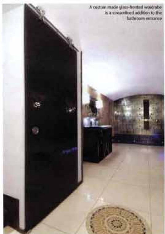
A custom made glass-fronted wardrobe is a streamlined addition to the bathroom entrance

Ludmila, head of interior design at the company, has focussed her energies on creating elegant and sophisticated interiors with plenty of warmth and theatre. Open the door to the show apartment and you're in for a treat: bespoke furnishings in dramatically designed settings, with plenty of added extras, be it the infinity ceilings with fibre optic lights in the cloakroom, the vast tropical aquarium in the entrance hallway, the objets d'art, including a Burmese volcanic stone Buddha over 2m high, or the futuristic island in the glossy kitchen. "Every single thing is specially designed and made to our specification," says Ludmila, who sourced most of the furnishings from overseas. "It wasn't only that we couldn't find what we were looking for in the UK and that we didn't