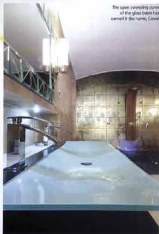
The open sweeping curve of the glass basin has earned it the name, Curve