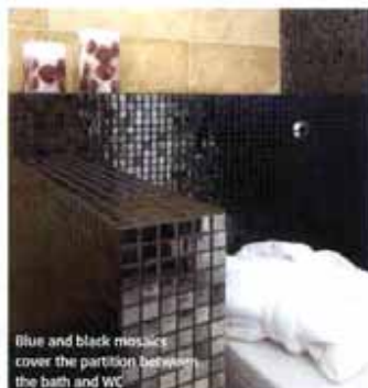
Blue and black mosaics cover the partition between the bath and WC