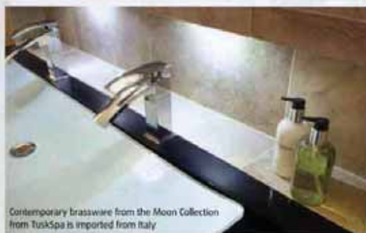
Contemporary brassware from the Moon Collection from TuskSpa is imported from Italy

I didn't want to go down the white route because I find that too clinical. Instead, I wanted something with the feel of the kind of luxurious powder room you might find in a swanky club