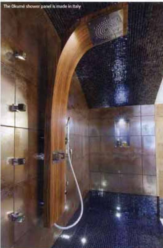
The Okumé shower panel is made in Italy