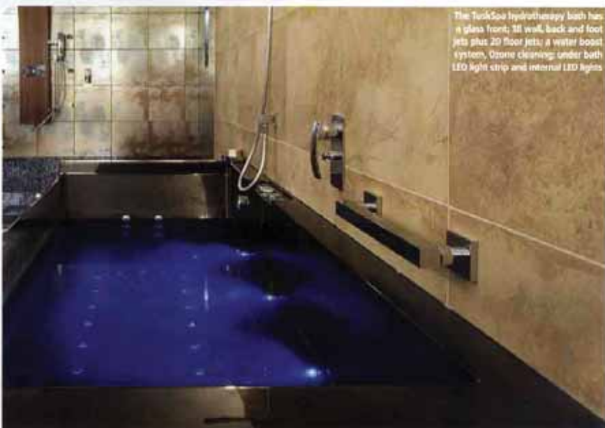
The TuskSpa hydrotherapy bath has a glass front; 18 wall, back and foot jets plus 20 floor jets; a water boost system, ozone cleaning; under bath LED light strip and internal LED lights

Unable to find a bath that was sufficiently sturdy, large and comfortable according to Ludmila and Martin's requirements, they set about designing their own, creating a series of hydrotherapy baths with up to 40 body jets and tinted glass fronts. Each of the bathrooms in the apartments is different, so they added custom-made, glass wash basins, lacquered vanity units and marine wood shower panels to the specially designed baths. "Our plan is to build Tusk as a luxury brand,"