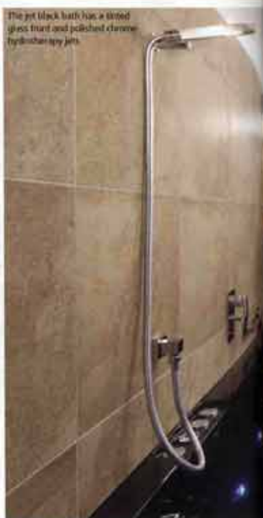
The jet black bath has a curved glass front and polished chrome hydrotherapy jets