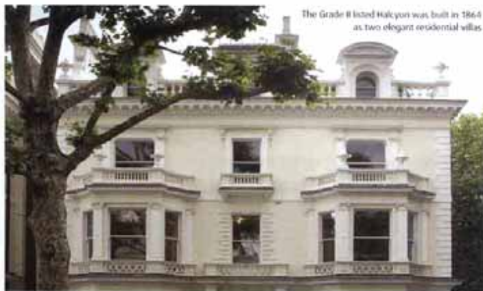
The Grade II listed Halcyon was built in 1864 as two elegant residential villas