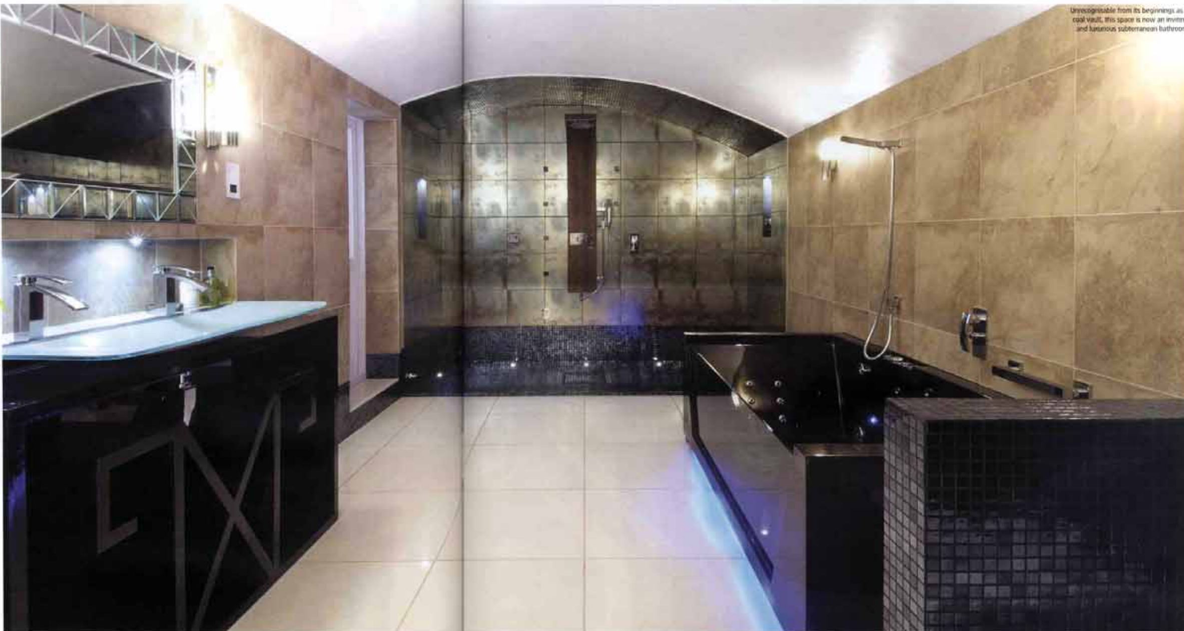
Unrecognisable from its beginnings as a coal vault, this space is now an inviting and luxurious subterranean bathroom