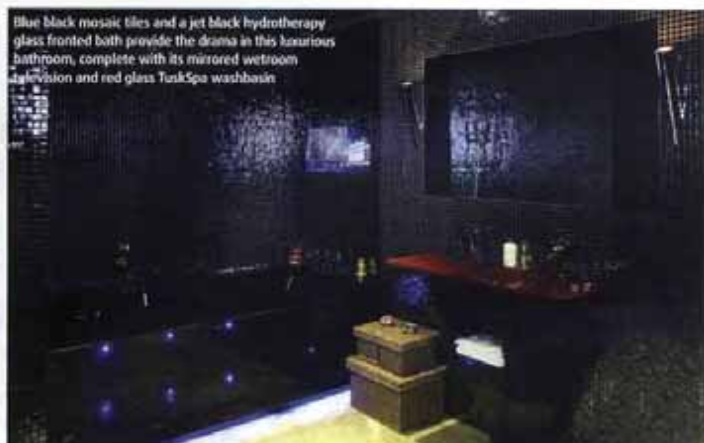
Blue black mosaic tiles and a jet black hydrotherapy glass fronted bath provide the drama in this luxurious bathroom, complete with its mirrored wetroom television and red glass TuskSpa washbasin