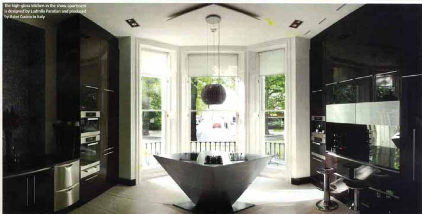
The high-gloss kitchen in the show apartment is designed by Ludmila Paratian and produced by Aster Cucina in Italy